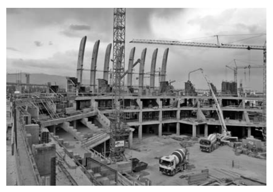
Figure 2. The real "site" of Zagreb Arena

According to the current authors' experience, local companies need to integrate both approaches to better plan and execute their construction operations. Creating comprehensive internal normative databases would help companies set internal standards for their products and services. Although many larger companies have, through time, elaborated their normative databases, small and medium sized companies still need to create them, to further stabilize their