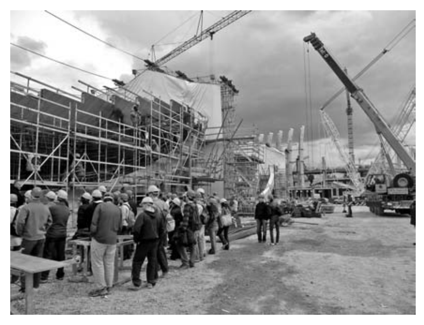
Figure 4. Students observed processes and "snap-shots" of Zagreb's arena"

market position and to reduce risk in planning their projects. Simulation techniques are complementary to this process as they enable an preliminary evaluation of multiple design options for construction operations in the bidding phase of a project, and better control of ongoing construction processes during the execution phase.