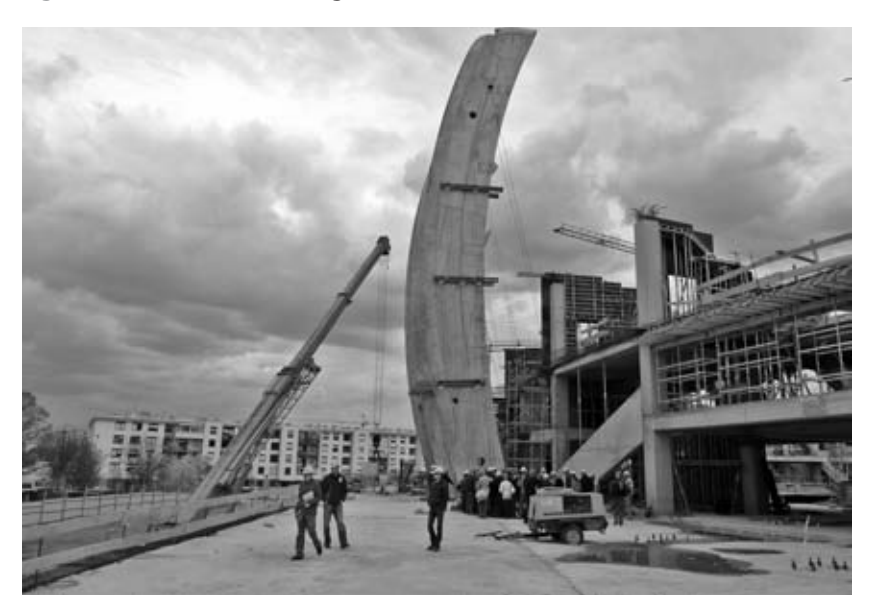
Figure 2. The construction part of Zagreb Arena