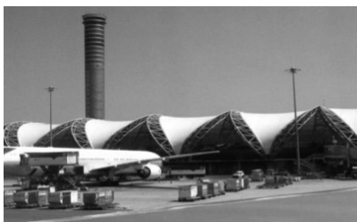
Second Bangkok International Airport, Thailand