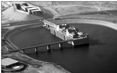
Toshka Project, Egypt