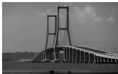
Suramadu Bridge, Indonesia