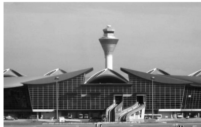
Kuala Lumpur International Airport (KLIA) Project, Malaysia